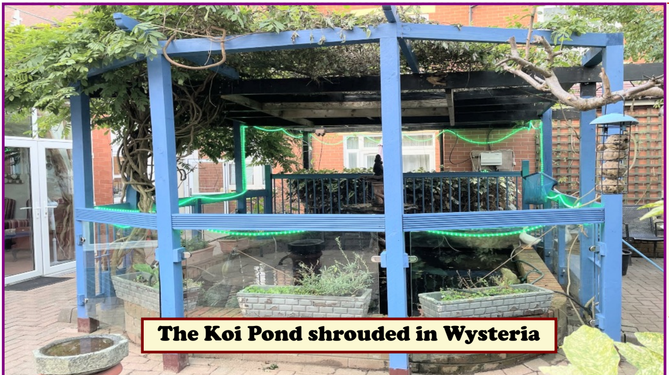
The Koi Pond shrouded in Wysteria