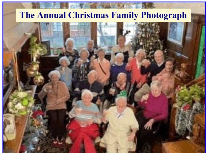
The Annual Christmas Family Photograph