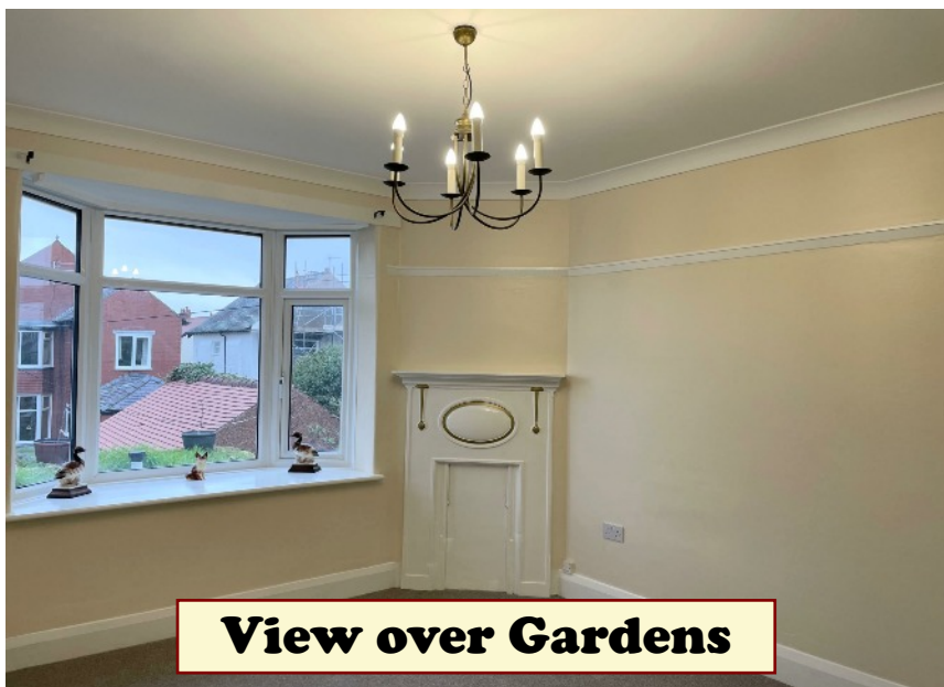
View over Gardens

Suite 20 - A Stylish single one bed suite with a modern walk-in wet room off the entrance lobby, a large separate lounge, which has a very modern fitted Galley kitchen, and with a view over our Private Sensory Gardens from the rear lounge bay window.