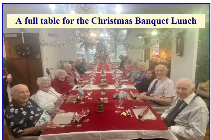
A full table for the Christmas Banquet Lunch

To arrange a personal viewing or to get a Full Prospectus call 01253 714121