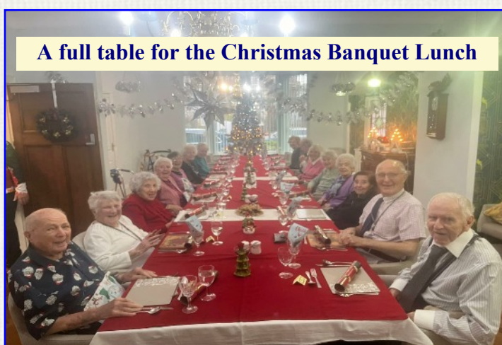
A full table for the Christmas Banquet Lunch

To arrange a personal viewing or to get a Full Prospectus call 01253 714121