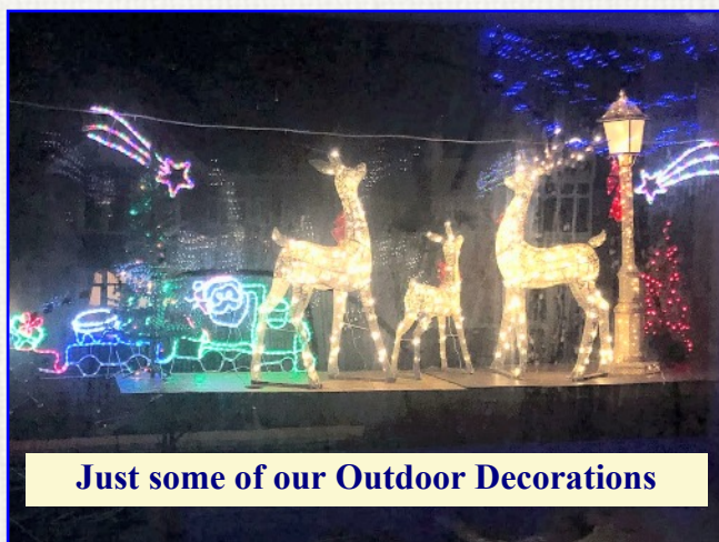
Just some of our Outdoor Decorations