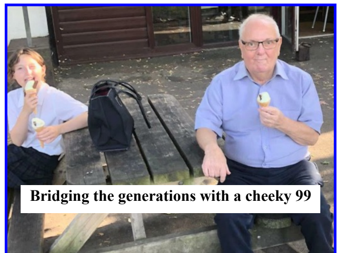
Bridging the generations with a cheeky 99

Three large GP Health Centres are within easy reach, Offering One Stop Health Care Services for our clients to meet most of your medical needs.