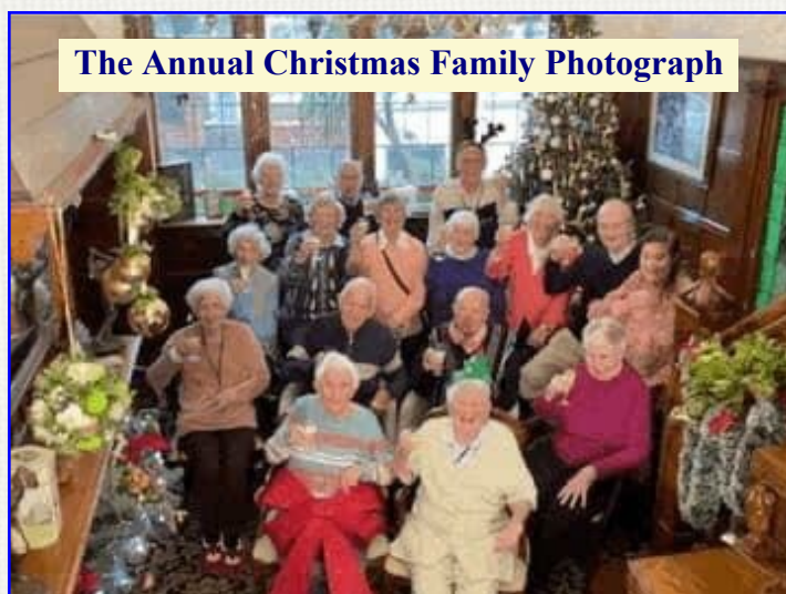
The Annual Christmas Family Photograph