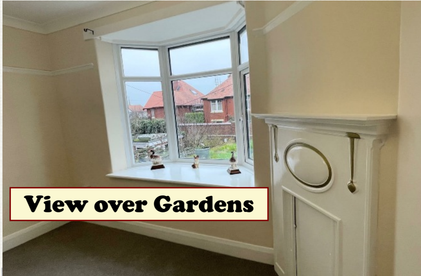
View over Gardens

Suite 20 - A Stylish single one bed suite with a modern walk-in wet room off the entrance lobby, a large separate lounge, which has a very modern fitted Galley kitchen, and with a view over our Private Sensory Gardens from the rear lounge bay window.